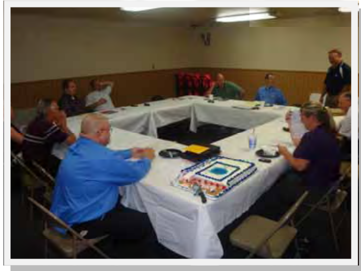
A variety of topics were discussed and even a formation of a new program for the entire BCSC. STAY TUNED!