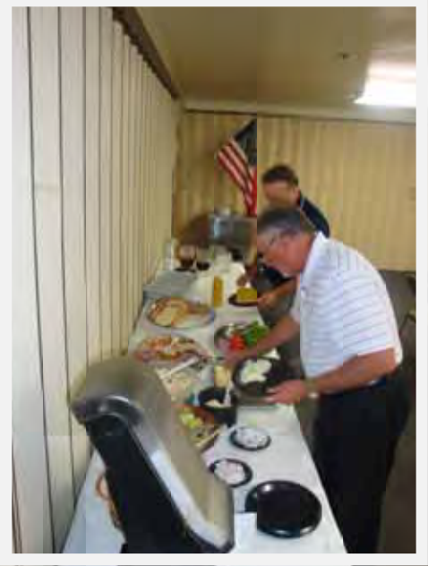
A delicious deli lunch spread was provided for all in attendance.